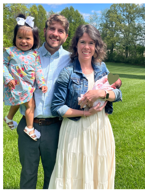
In the fall of 2023, our family embarked on a new journey, we opened up our home for foster children.

We prayed a lot over this decision and decided it was what the Lord wanted us to do. Fostering for us has been such a blessing even with the difficult circumstances.