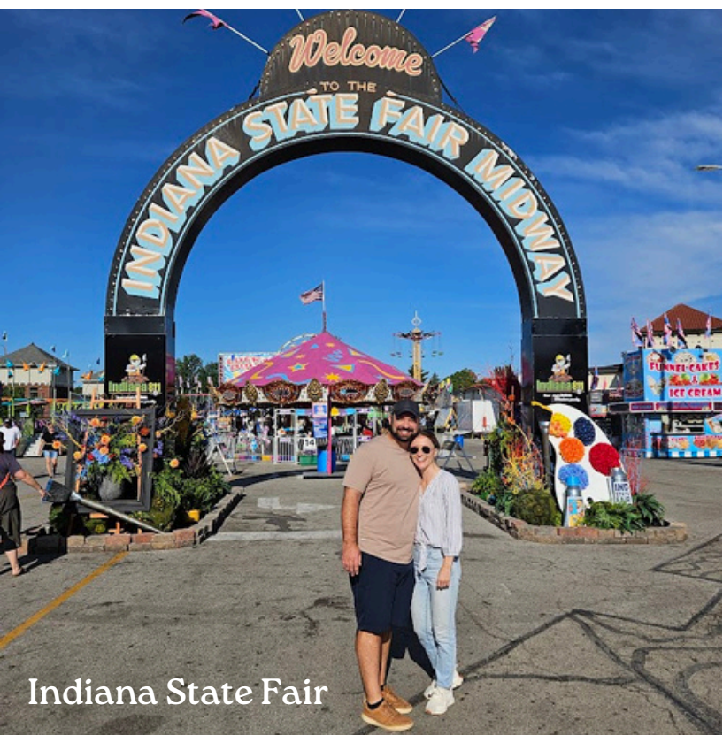
Indiana State Fair

Our neighborhood is very active in creating a community and a welcoming environment. The neighborhood association hosts an art fair and block party every year and most recently had a “meet your neighbor” night at a local restaurant. There is a park just a few blocks from our house, where we often see families playing. We enjoy going to Fall Creek Trail for walks, runs or bike rides. As much as we enjoy, exploring lands outside of Indiana, we also make a point to explore our home city. This summer we even created a “summer bucket list” to make sure we take advantage of some of the fun things Indianapolis has to offer.