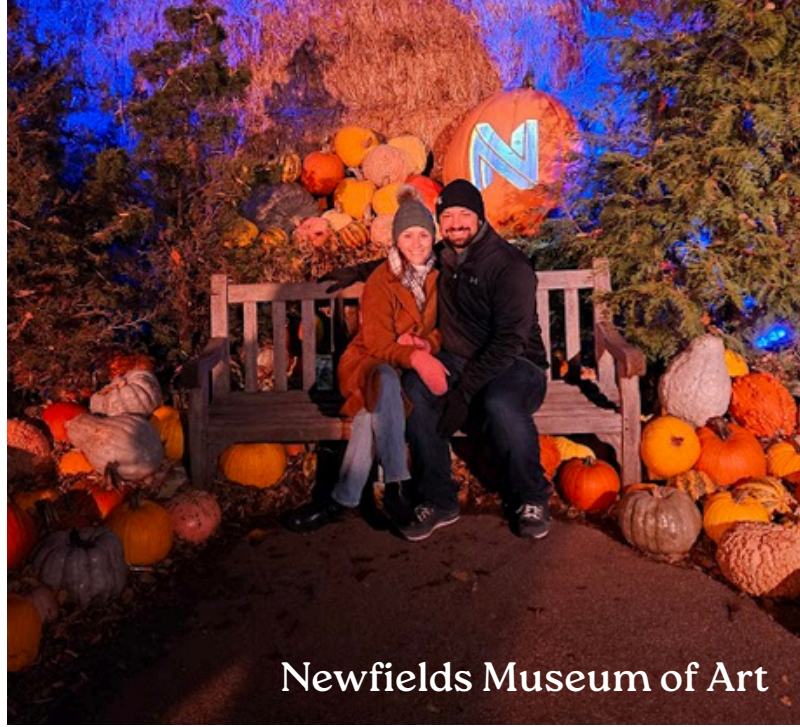
Newfields Museum of Art