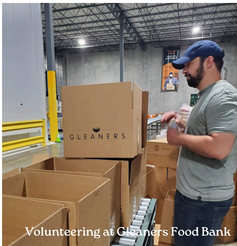
Volunteering at Gleaners Food Bank