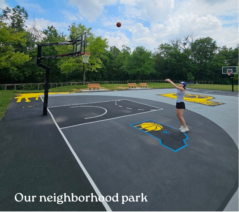
Our neighborhood park